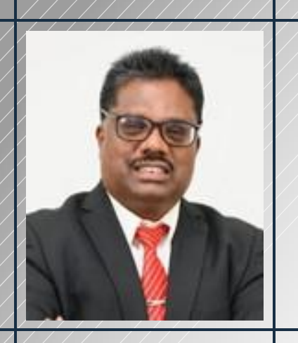
GUEST OF HONOUR